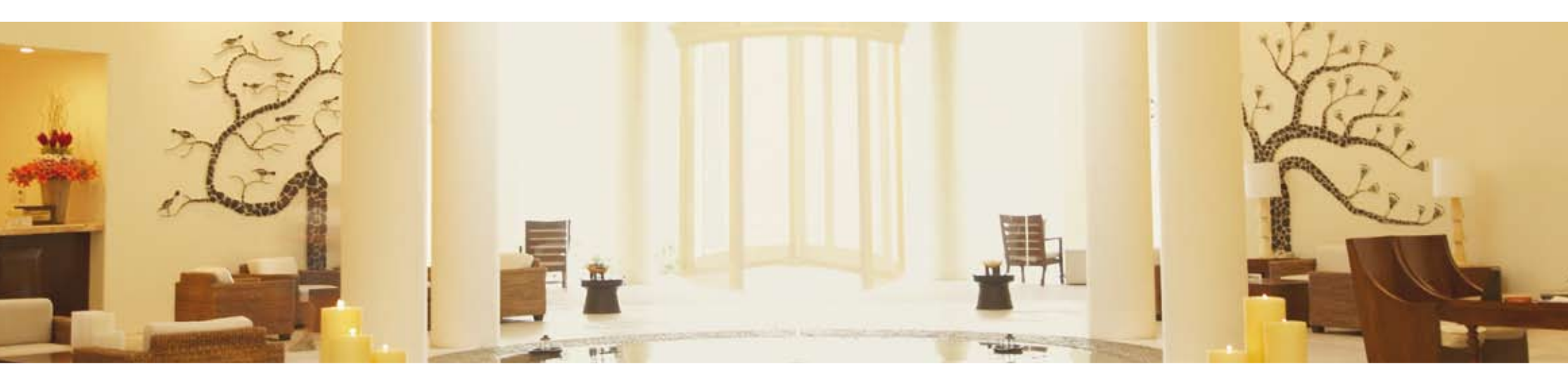
making an entrance.....the hotel collection